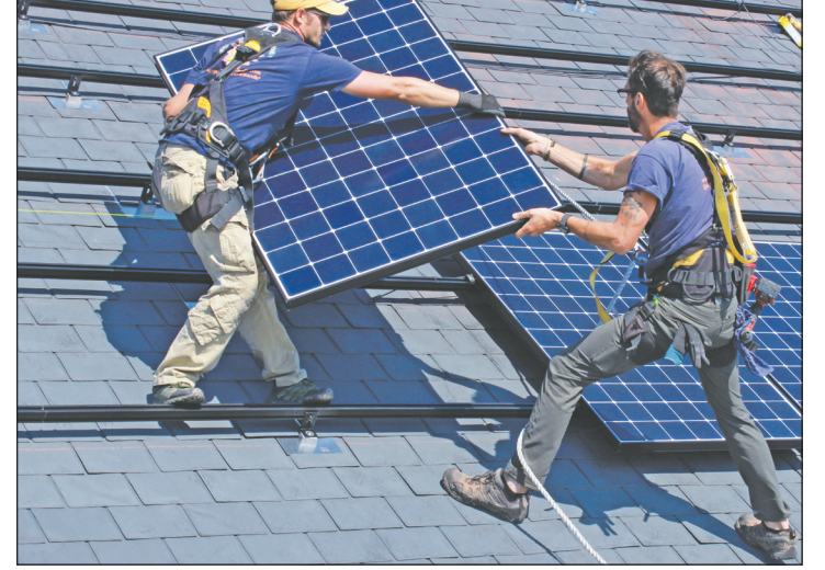
Power Trip Energy Corp are general contractors and electricians, installing approximately two residential solar arrays per week.

pole-mounted tracking systems for residential, commercial, non-profit and government projects. We are averaging two PV system installations every week without sub-contracting any of our work and all under the direct supervision of the company's owners.