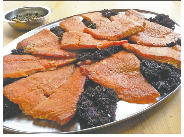
GBF Catering offers a wide menu of food options ranging from soups and salads to entrees and desserts as well as appetizers, including Ty's Perfectly Smoked Salmon Platter.