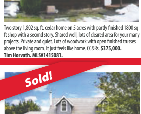
Welcome home to this great 4 bdrm/2 bath home centrally located in picturesque Port Townsend. Large double lot offers tons of room for outside activities including covered porch with outdoor kitchen, mature fruit trees, garden space and shop with loft. Nice studio nestled around back. Ian Meis. MLS#1361230.