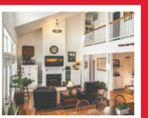
Private Port Townsend location on 5 pristine acres including Olympic Mt. views. Modern day farmhouse w/the 'Magnolia' vibe features generous rooms, soaring ceilings & amenities designed for comfort. Greatroom. HW floors. Fireplace. Incredible Kitchen w/Butler Pantry & Breakfast Bar seating 6+. Ensuite Master w/huge His & Her Closet. Office w/separate entrance/deck. Basement plumbed & ready for finishes - also plenty of room here for full workshop. Gracious drive onto the property. Perfect! $739,000. Paula Clark. MLS#1392152