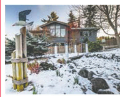
Bright elegance awaits you in this 3.115 sg. ft. Kala Point home w/partial water view. Architecturally lovely w/vaulted ceiling, skylights, walls of windows, beautiful fireplace. HW floors, granite counters, new appliances, master on main w/stunning bath. Community amenities. $699,000. Christine Cray. MLS#1410665.