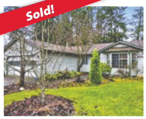
Beautiful unique custom built home all on one level. Views of Port Townsend Bay and Indian Island. Property backs up to Fort Townsend State Park, enjoy the trails. Secluded from the street, very light and bright with skylights and lots of windows. $588,888. John Eissinger. MLS#1370059