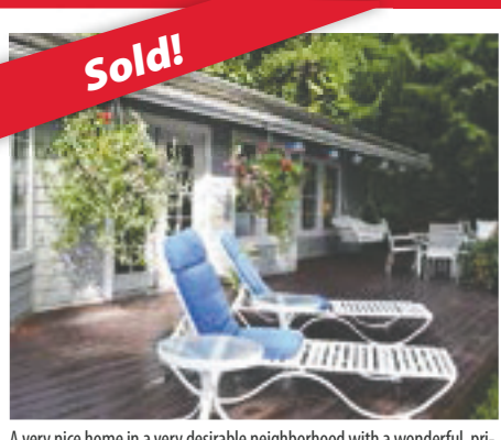
A very nice home in a very desirable neighborhood with a wonderful, private backyard for gardening. Attached 2 car garage. Large deck with hot tub, covered natio. Gas range and oven, refrigerator, dishwasher included. 3 BR, 2 BA w/family room. $270,000. Michael Carter. MLS#1398826