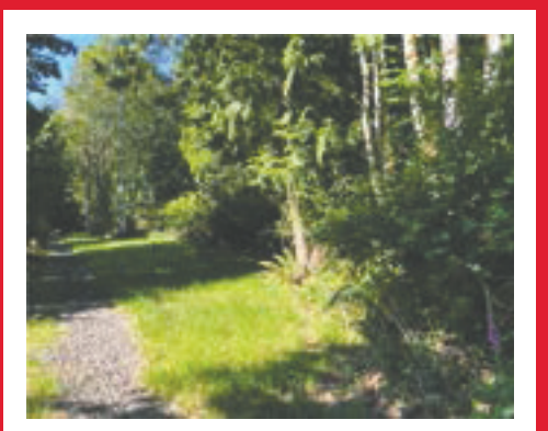
Nice gently sloped lot in Port Ludlow's North Bay community. Nicely treed, dead end cul-de-sac. Comes with access to Beach Club which offers an indoor & outdoor pools, work out room, community beach, & more! Water & power in street. Buyer to verify all utilities. CC&Rs. $22,900. Michael Carter. MLS#1313059.