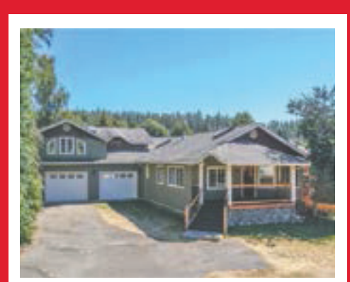
Location & style! This Cape George home offers open design & room to expand! Natural light throughout house, island style eat-in kitchen w/ stainless package, en-suite master, radiant heat & wood burning stove. Big covered deck. Unfinished space above 2 car garage. Amenities too! $339,000. Ian Meis. MLS#1414249.

Double private parcel tucked away in desirable Ocean Grove, w/2 bdrm hook-up allowed to community drainfield. Low fees in this beautiful community, just $20 per year per lot, which includes access to 200' of community owned Adelma Beach, private walking trails & secure RV/boat storage. DNR land across the street guarantee privacy. Includes p 56, corners to be marked. $67,500. Terry Smith. MLS#1274851