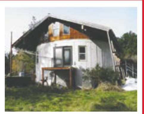
Sunny level 1.72 acres outside of Port Townsend. Home was in the process of being remodeled, but was not finished. The basement is 929 unfinished s.f., the upper level 480 s.f. which is also unfinished. There is a bathroom roughed in upstairs. Needs some TLC. Property is being sold AS-IS. $150,000. Terry Smith. MLS#1414802.