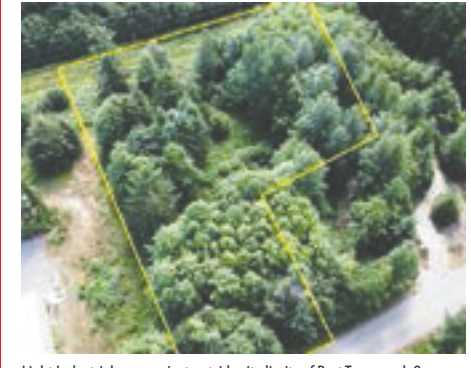
Light Industrial acreage just outside city limits of Port Townsend. On water view side of Otto St. to South of 192 N. Otto St. 130' Frontage on Otto St. & over 75,883 sq. ft. of land. Will require septic system, buyer to investigate permit requirements. Includes 2 tax parcels. Water available. $109,900. Charlie Arthur. MLS#1312338.