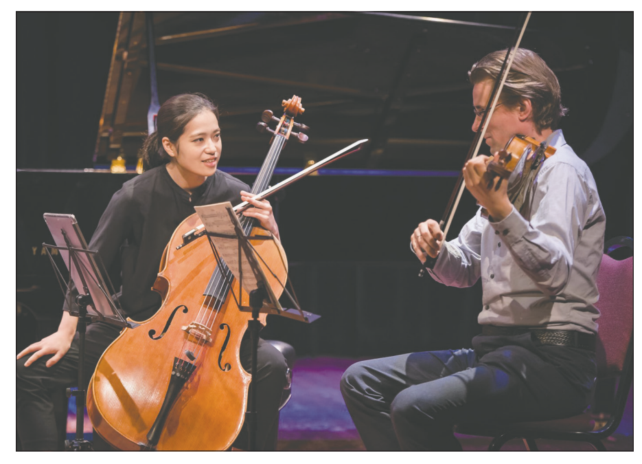
Rehearsal

Program planning requires OMF staff and musicians to be nimble. All the artists are well versed in protecting their health and the health of those around them.