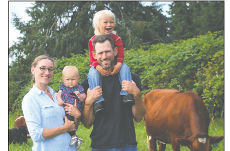
One Straw Ranch

Facebook: https://www.facebook.com/eatlocalfirstolympen/