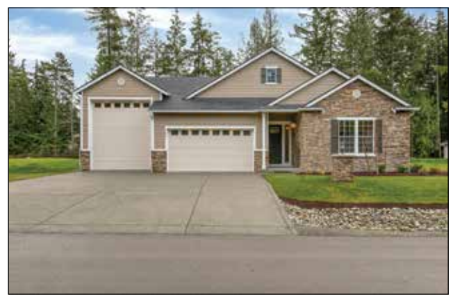
We love the neighborhoods we build in and want them to be clean and green for years to come!

Being environmentally responsible is also a priority for us. We recently launched a nationwide campaign spotlighting our energy-efficient home features and we're now pleased to offer solar power options at most of the communities in which we build. We also use efficient homebuilding features to help cut energy and water waste without cutting comfort and convenience.