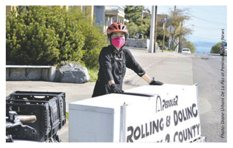
▶ BIPOC Businesses continued from pg. 4