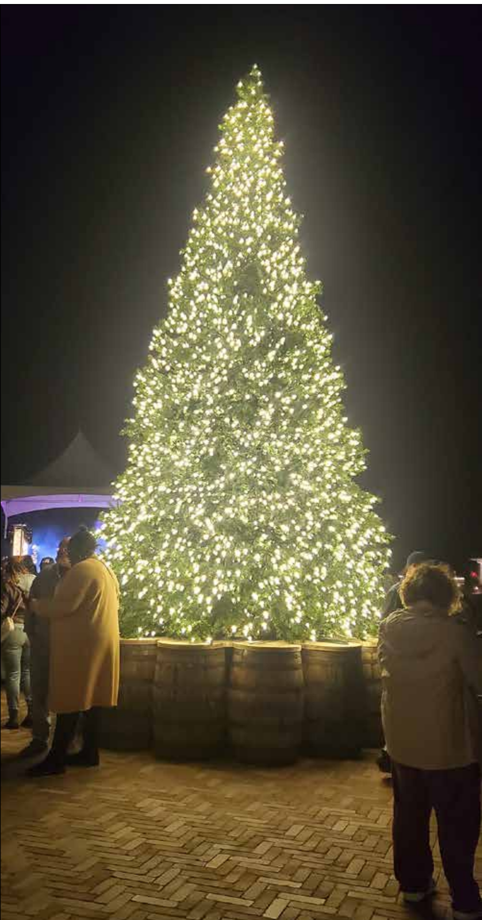
Uncle Nearest Green tree lighting.