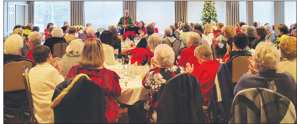
Wednesday's concert was a full house at the Riverbend County Club.