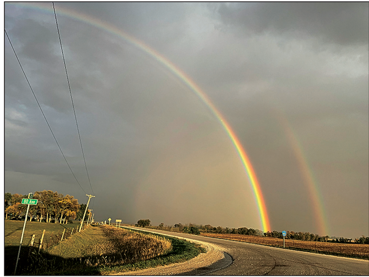
Nature's beauty could be seen Friday night, October 1st south of Swea City and west of Bancroft. After a short rainfall, a double rainbow filled with bright colors appeared to be ending in the one of the fields that had been recently harvested.